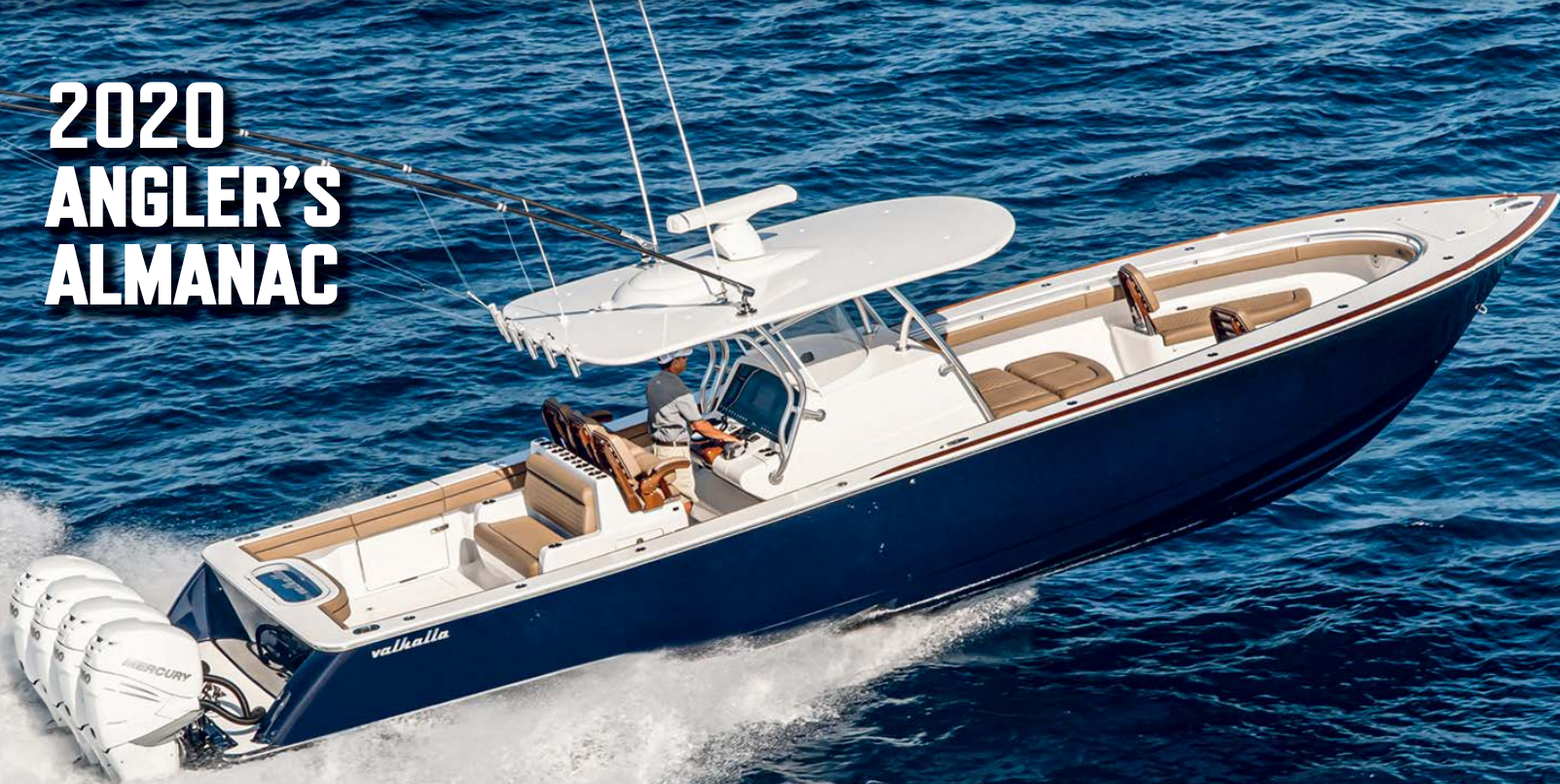
VALHALLA BOATWORKS V-41